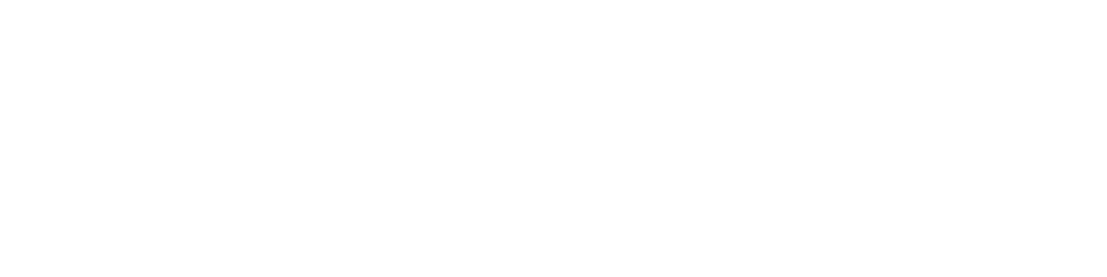
Dvorak: Symphony No.8 in G Minor – 4th Mvt., Figure C-D [1<sup>st</sup> Horn] In F